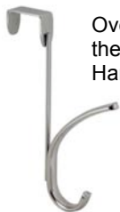
Over- the-Door Hangers