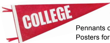
Pennants or Posters for Walls