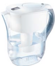
Brita Water Filter