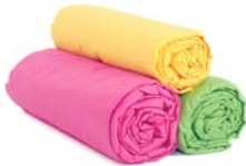
Bed Sheets (twin extra long)