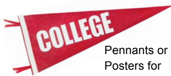
Pennants or Posters for Walls